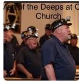
Men of the Deeps at Church