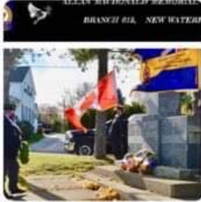
BRANCH 014, NEW WATERFORD