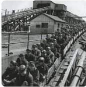
Lingan Heritage Society