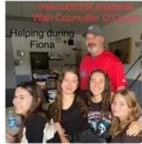
International Business Women Council of New Waterford Helping during Fiona