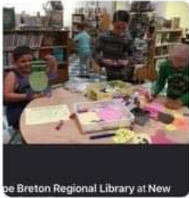
at Breton Regional Library at New Waterford