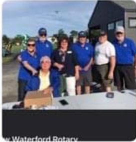
New Waterford Rotary