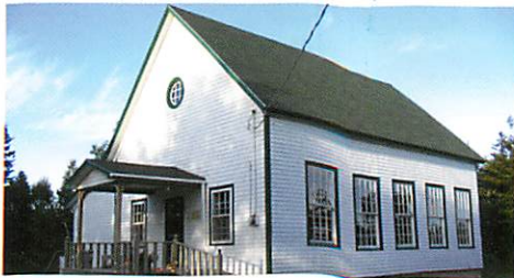
Cape George Heritage School Museum

sized model of a bluefin tuna. Prominently displayed is an antique Fresnel lighthouse lens, which is an exact match to the one originally used at the nearby Cape George Point Lighthouse.